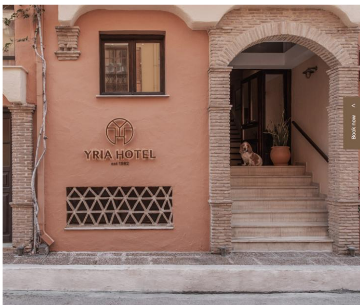
Figure 1: The entrance to the Yria Hotel

Most visitors to Zakynthos arrive by bus. Buses from Athens to Zakynthos depart from Kifisou station, platform 38 and take about 7 hours. Kifisou station can be easily reached from Athens airport by bus X93 (€5), which takes about 45 minutes and arrives exactly where the bus to Zakynthos is waiting to depart. For bus schedule, see Ktel Buses . There are also many ferries connecting the port of Kyllini (mainland Greece) and Zakynthos. For ferry schedule, see Levante Ferries .