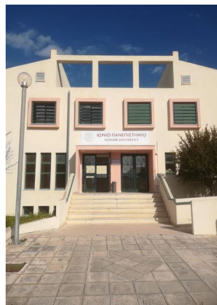
Figure 2: Entrance to the Department of the Environment at the Ionian University